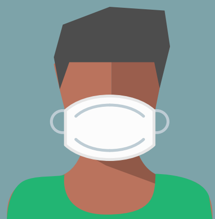
Person with COVID-19